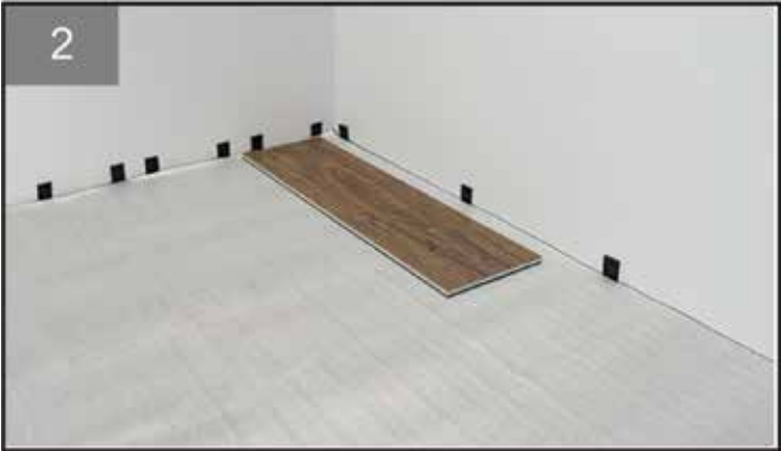
Figure 2: Begin by cutting plank 1 in half. Position the cut end of plank 1 against the wall in the left corner of the room.

It is very important that the first two rows are installed properly. Installation will alternate back and forth between rows one and two, for the first two rows only. The first row of planks will be placed with the grooved edge facing outward into the room.