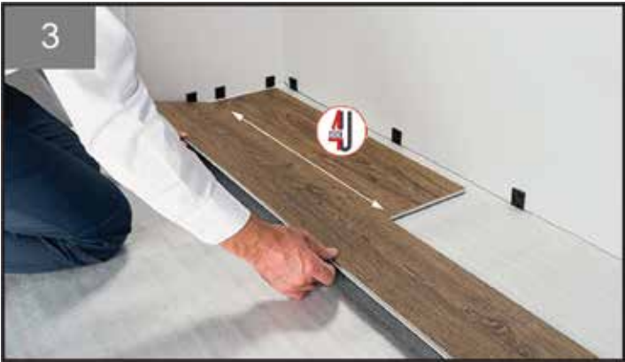
Figure 3: Use a full length for Plank 2 which will be installed in the second row. Align plank 2 at an angle, onto the long side of plank 1 making sure there are no gaps. Drop plank 2 to lock in place.