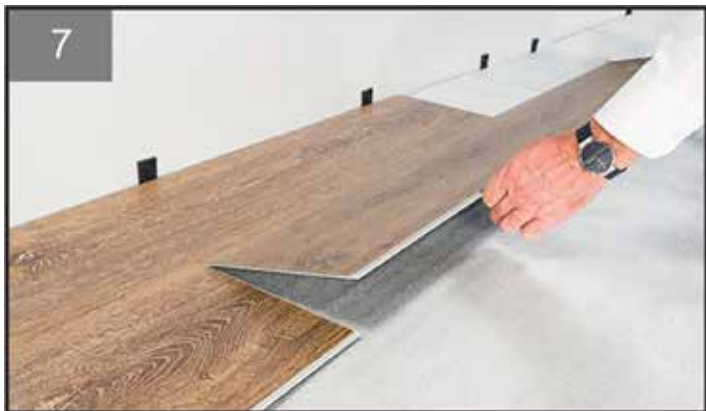
Figure 7: Continue alternating planks on rows 1 and 2. Ensure planks are properly aligned along the chalk line and against the spacers. Finish rows 1 and 2 in this manner, cutting planks at the end of the row as necessary. Ensure that the end planks are a minimum of 6" in length. If necessary, adjust the length of the starter pieces to ensure minimum plank lengths for each row, with proper end joint stagger row to row.

Installation of all additional rows will start by angling a plank on the long side and sliding plank to the left until the short sides are in contact. Lock the short side as instructed for rows 1 and 2 using rubber mallet to engage locking system as shown in Figure 5.