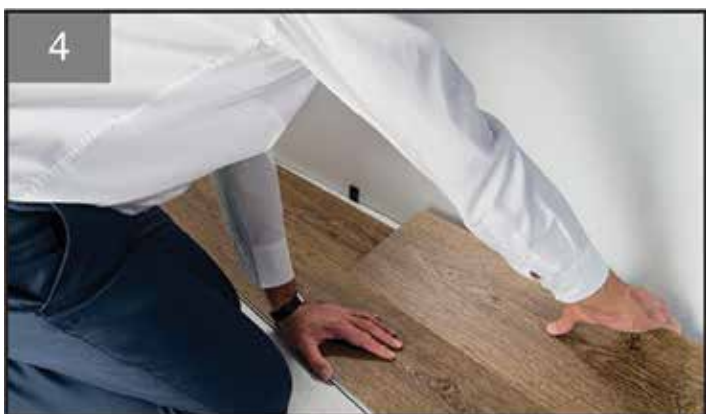
Figure 4: Working from the wall, insert plank 3 into the long side of plank 2.