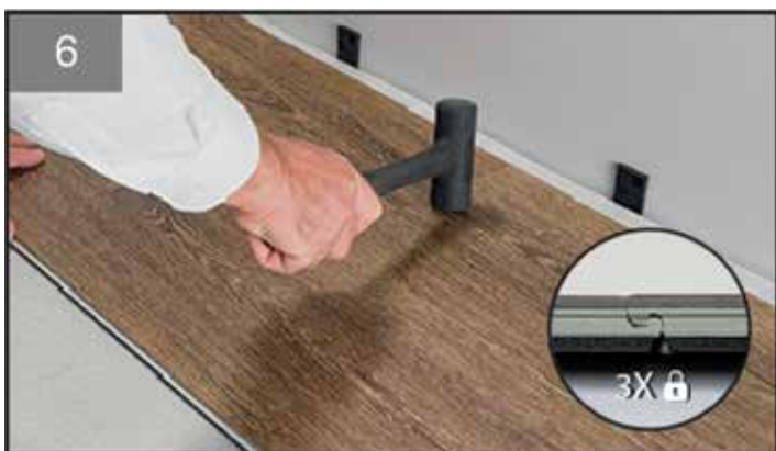
Figure 6: Using a rubber mallet, lightly tap the joint on the short side to engage the locking system.